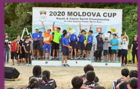
2020 Moldova Canoe Cup hosted by Nishikawa Town