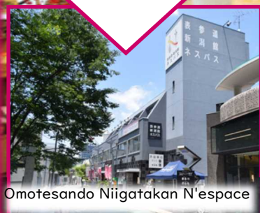
Omotesando Niigatakan N'espace

Do you know what "N'espace" means? Now, let's find the answer and unravel the secret of popularity!