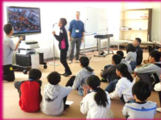
Exchange with Penrith Elementary School

International exchange using Skype in Fujieda City, Shizuoka Pref.