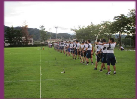
Remote friendly match of Archery in Tsuruoka City

Remote exchanges build new bridges between the country and its Host Towns, Tsuruoka City and Nishikawa Town in Yamagata Prefecture.