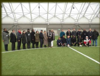
Diplomats visited the all-weather training field in J-Village

I n January 2019, participants of the diplomats' Tour visited the all-weather training field in J-Village, that opened in September of the previous year. It is the largest indoor training field in Japan, and the spacious field is covered with lush artificial turf. J-Village is the starting point for the torch relay of the Tokyo 2020 Games. Next spring, Japan will highlight the "Recovery Olympics and Paralympics" from Fukushima!