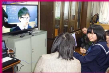
Exchange with Joyang Middle School

F ujieda City, having a sister city relationship with Penrith City in Australia and Yangju City in South Korea, has actively continued international exchanges using Skype between elementary schools and junior high schools since 2014. Through a wide variety of interactions using pictures, photographs and demonstrations, students come to realize the importance of face-to-face communications. Let's take a look at their online exchanges in the classroom.