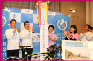
Designation ceremony as the National Cycle Route

I n Shiga Prefecture, you can enjoy cycling at "Biwaichi" 200km cycling route around Lake Biwa, while watching the beautiful scenery and historical heritage that spread along the shore of the lake.