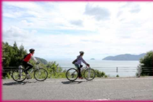
National Cycle Route "Biwaichi"