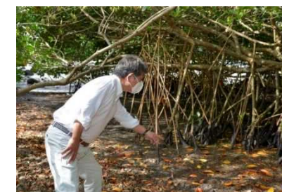
Visit by the Minister Motegi to an area damaged by the oil spill