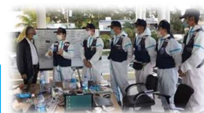
Visit by the PM of Mauritius to the JDR Expert Team