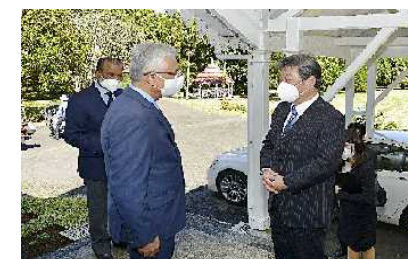
Visit by the PM of Mauritius to the JDR Expert Team