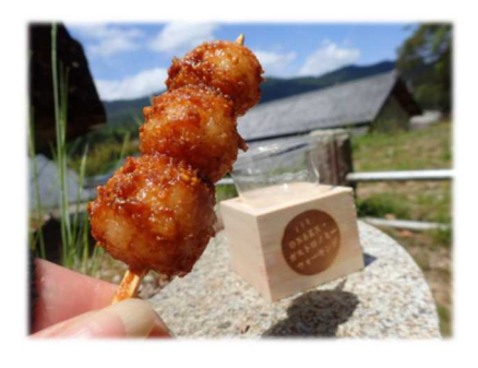
Goheimochi, a local cuisine in Nakatsugawa City, Gifu Prefecture

Vitalization regional areas by ONSEN Gastronomy Tourism in Gifu Prefecture