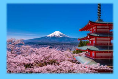
A view of Mt. Fuji from Niikurayama Asama Park in Fujiyoshida city

ujiyoshida City, Yamanashi Prefecture, registered as a Host Town of France, promoted a project as part of its Host Town Initiative, using its excellent local textile fabrics to make costumes for internationally famous French ballet dancers. The project aimed for further improving recognition of its textile products and expand the market overseas. This initiative was also introduced at the official program of "Japonismes 2018" held in France.