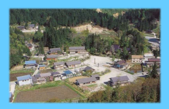
The Soba Village constructed in Nanto city

Soba (buckwheat) brought two villages sister-city relations -exchanges between Nanto City in Toyama, Japan and Tukuche village in Federal Democratic Republic of Nepal-