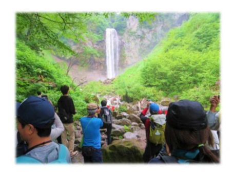
Hirayu Otaki, Grand Waterfall

ifu Prefecture is actively working on promoting "ONSEN Gastronomy Tourism". It's an unique style of traveling in Japan. It offers tourists opportunity to visit a regional area, where they can taste the local cuisine, explore the history and culture, admire natural landscape, and enjoy the delights of world-class onsen (hot springs). It is attracting attention as a tool to appeal regional areas to foreign tourists.