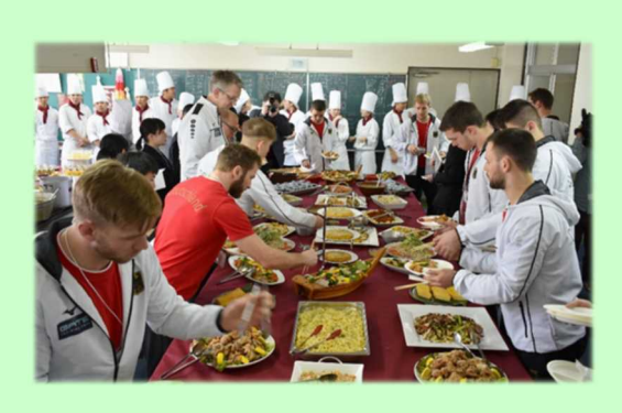
High school students serve the dishes to athletes

As your Host Town, we welcome you by serving original dishes made of our local product!