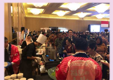
Booth of Gifu Prefecture