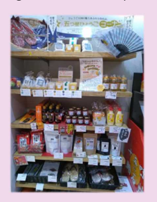
'5 Stars Hyogo' corner

cialty from Kobe and other places in Hyogo. There are lots of attractive local products from Hyogo's 5 areas, including specialty products named '5 Stars Hyogo'. Please enjoy meeting with exciting Hyogo. We look forward to your visit.