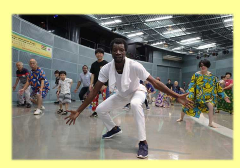
Citizens enjoy dancing with Togolese dancers at an event hosted by Hyuga City

yuga City, Miyazaki prefecture and the Republic of Togo started their Host Town exchanges, because the name of "Togo" town in the Hyuga city has the similar reading with the country's name.