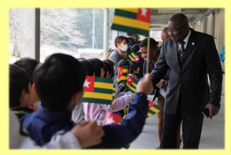
Elementary school students in Hyuga City welcome a delegation from Republic of Togo

Host Town exchange : Hyuga City/Togo Town, Miyazaki Prefecture, and Republic of Togo