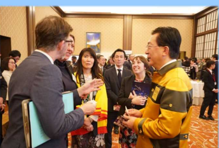
As a drummer in Morioka Sansa Odori Festival