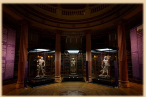
Exhibition of Kofuku-ji's Buddhist statues in Guimet Museum, Paris