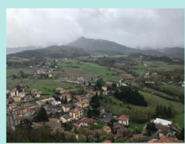
scenery of the Zavattarello