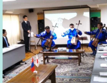
performance of Morin khuur