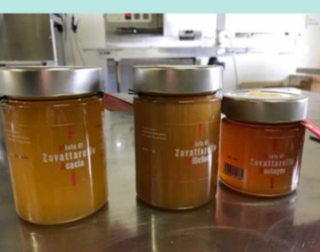
ocal specialty, honey

Zavattarello is located 100km south of Milano City. It is a scenic town on a hill. You look over beautiful Medieval towns from the Dal Verme Castle in the town. Their local product, honey, is very famous in Italy. Zavattarello, which had historical ties with Japan in 19th century, is looking for a sister-city in Japan.