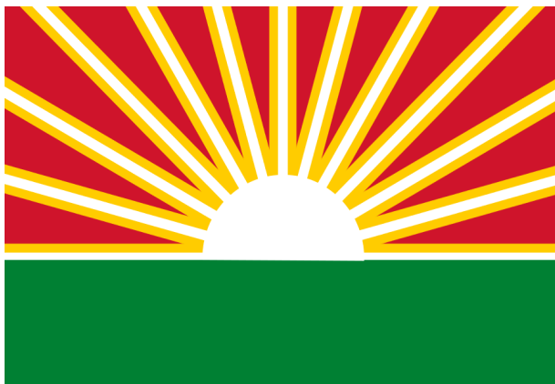
Flag of Lara State, Venezuela (1901-)