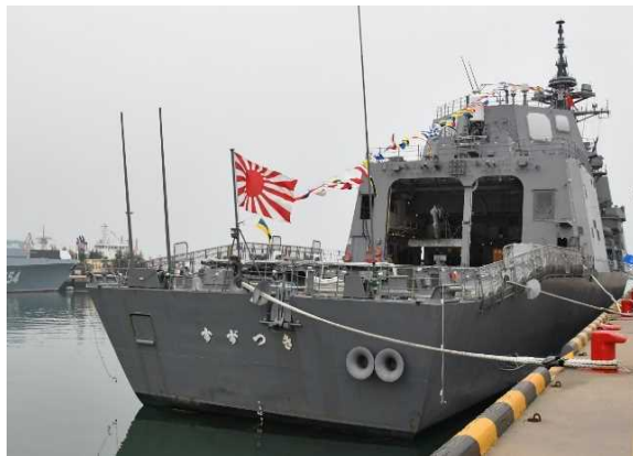
Naval event in Tsingtao 2019 (a Maritime Self-Defense Force vessel entering in Tsingtao port)