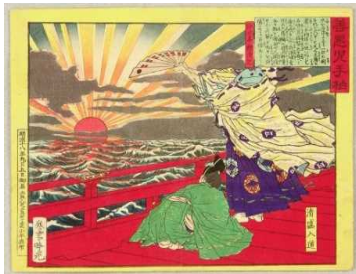
Priest Kiyomori, an old Kabuki story , by Ginko Adachi, 1885