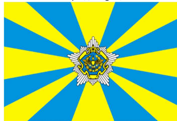
Flag of Belarus Air Force (2001-)

https://www.mil.by/ru/encklop/heraldry/vvspvo/