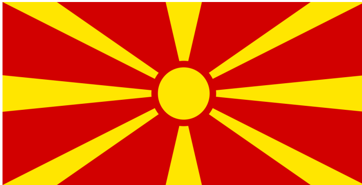
Flag of the Republic of North Macedonia (1995-)

The design of the rising sun with beams of lights is not unique to Japan. Similar designs are widely used in the world, as seen in the national flag of Republic of North Macedonia, the state flags of Arizona, the U.S. and Lara, Venezuela as well as the flag of the air force of Belarus.