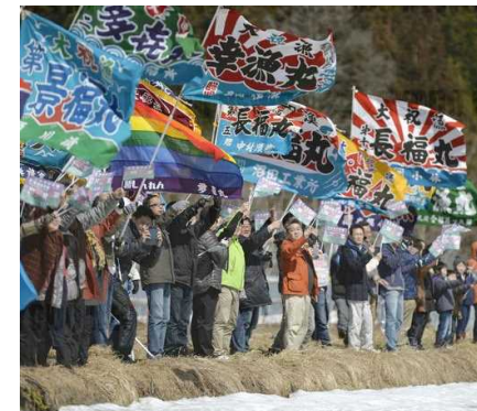
People celebrating the opening of the Hokkaido Shinkansen with big fishing flags, 2016