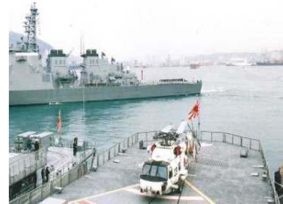
Naval event in Busan 1998 (a Maritime Self-Defense Force vessel entering in Busan port)