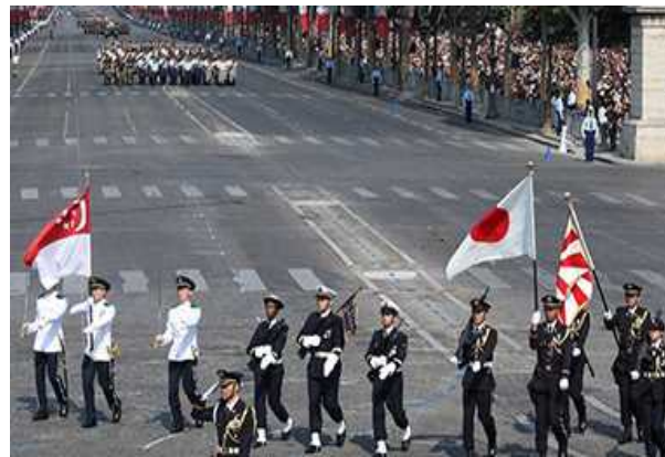
A parade in Paris in 2018 (a Ground Self-Defense Force unit with a Singaporean unit)