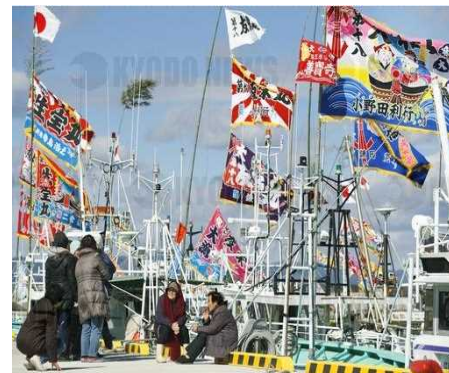
The return to Ukedo port (2017) of fishing boats that had evacuated due to the Great East Japan Earthquake