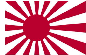
The flag of the Maritime Self-Defense Force

The flags of the Maritime Self-Defense Force and the Ground Self-Defense Force employ the design of the Rising Sun, in accordance with the Order for the Enforcement of the Self-Defense Forces Law in 1954.