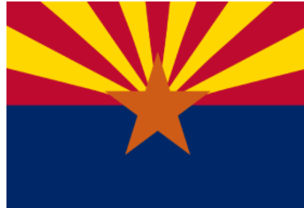
Flag of Arizona State, the U.S. (1917-)