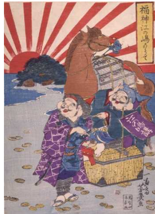
An ukiyoe print, Lucky gods Visit Enoshima Palace , by Yoshiiku Ochiai, 1869