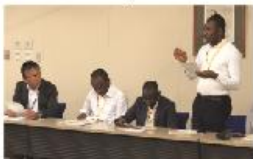
ABE Initiative (African Business Education Initiative)