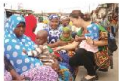
Health Experts in Lagos