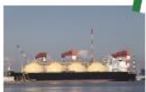
LNG (Liquefied Natural Gas)