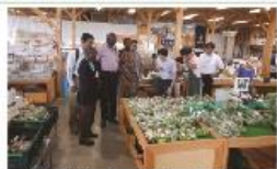
JICA's Agricultural Policy Program in Japan