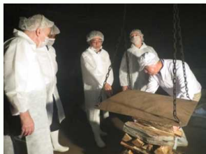
bonito processing factory