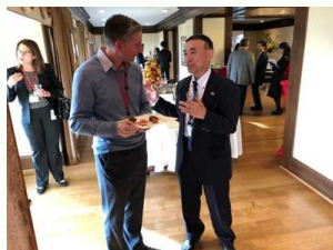
exchange of opinions

On October 24, "Japan Cruise Seminar in Seattle 2018", co-organized by Japan Sea and Seto Inland Sea Ports (Port of Aomori, Kanazawa, Sakai, Kitakyushu, Hiroshima and Kobe), was held in Consul General's official residence in Seattle. The aim of this seminar was to expand the number of stops of U.S. cruise ships and foreign passengers. Representatives from the six ports presented their own receiving plan of cruise ships and attractiveness of tourism around the port. In the reception after the seminar, local culinary products and Japanese Sake from the regions where ports are located were served to the participants.