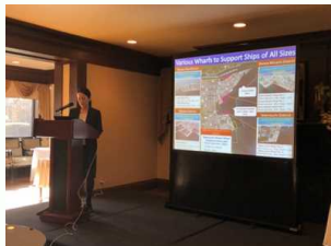
presentation in the seminar