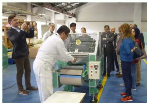
paper technology center