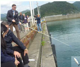
trying bonito pole-and-line fishing

From October 25 to 26, the Ministry of Foreign Affairs and Kochi Prefectural Government co-organized Ambassadors' Study Tour to Kochi Prefecture. In the tour, ambassadors visited disaster prevention facilities for tsunami and earthquake and had discussions of related matters. The ambassadors also visited Kochi's traditional industrial facilities - paper and Sake brewing factories. Furthermore, the ambassadors heard explanation about the Kochi's efforts for protection of sustainable fishing industry and water resources in Kure Harbor, which is famous for Katsuo Ippon-Zuri (bonito pole-and-line fishing).