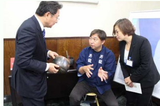
Demonstration of Takaoka Copperwares

On August 7, "Toyama Specialties Seminar" co-sponsored by Toyama Prefecture and Consulate-General of Japan in Shenyang was held at the residence of consul-general in Shenyang. In this seminar, the charms of Toyama Prefecture were introduced to local media, buyers, government officials, travel agencies. Exhibition and demonstration of Takaoka Copperwares (Traditional craft of Toyama Prefecture), making performance of Japanese confectionery, tasting of local sake drew attentions of participants.