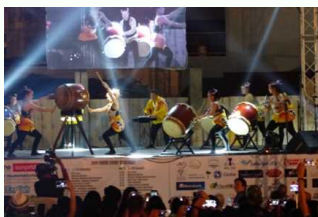
Japanese drums performance