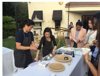
rice ball using the rice produced in Kumamoto

On August 17, "Kumamoto Promotion Event" was held at the residence of consul-general in Los Angeles. When "Kumamon" (a mascot of Kumamoto Prefecture) appeared and performed "Kumamon" exercise on the stage, the event became livelier. Kumamoto's specialties such as sake, shochu, ramen, rice balls were provided. Kumamoto Prefecture tries to restore from the Kumamoto earthquake in 2016, and it is expected for the partial restoration of the castle tower of Kumamoto castle, the opening of "Kumamoto Castle Hall", games of the Rugby World Cup and the Women's Handball World Championship in Kumamoto in 2019.