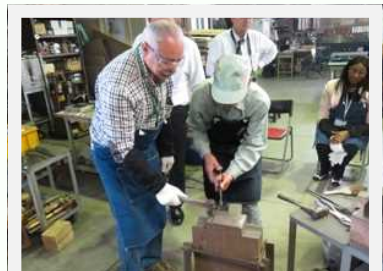
Diplomats enjoyed making products in tsubame-sanjo area

Upon visiting this area, you will be warmly welcomed by their one of a kind craft and skill.