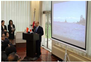
Governor of Toyama Prefecture, Takakazu Ishii