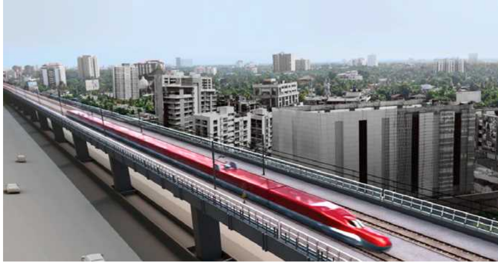
Computer graphics of the Mumbai-Ahmedabad High Speed Railway(MAHSR)

High Speed Railway Project: Connecting India's largest city Mumbai with Ahmedabad, a prospering commercial and financial center