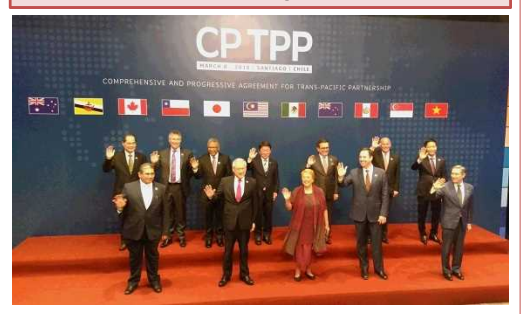
Signed on March 8, 2018 in Santiago, Chile