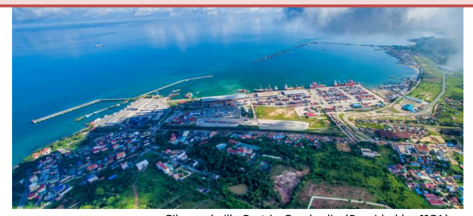
Sihanoukville Port in Cambodia