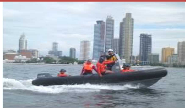
Technical guidance to the staff of the Philippine Coast Guard