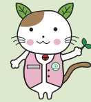
KUSANONEKO (Grass-Roots Cat in Japanese) This character appeared at Global Festa JAPAN 2017 exposition held in Tokyo, prior to the 30th anniversary of Grass-Roots Grant Assistance. The cute character holds a blade of grass in its paw and brings smiles to people around the world.