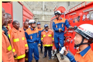
Kenya: The "Project for Reusing Secondhand Fire Engine in Nairobi City County," FY2015

Japan provides assistance by providing fire engines and ambulances originally used in Japan to countries and regions overseas that need them. For instance, Japan helps pay the repair and shipping costs of these fire engines.