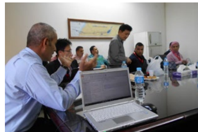
Lecture and discussion led by experts

Given these circumstances, Japan held a country-focused training called the Capacity Development Training for personnel of Suez Canal Authority with the goal of enhancing the knowledge and skills needed to properly operate the Suez Canal. This training for employees of the Suez Canal Authority included lectures on, the latest trends in the maritime transport market and site visits to container terminals. The training also consists of analysis and exercises of canal traffic amount prediction modeling and toll setting system in order to improve the necessary practical skills for optimizing income from the Suez Canal.