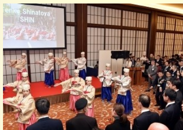
Yosakoi Naruko Dance

On February 19, a reception was co-hosted by the Minister for Foreign Affairs and the Governor of Kochi Prefecture at the Iikura Guest House. At the event, the Prefecture engaged in promotion of its various attractions such as tourism, food, traditional crafts, disaster prevention technology, and a unique style of group dance “Yosakoi Naruko Dance”.