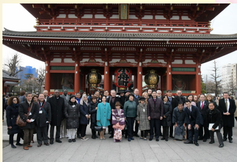
Hozomon Gate, Senso-ji Temple

On February 21, the Ministry and Taito City, Tokyo jointly organized a study tour to Asakusa District, targeted to diplomats stationed in Japan, in order to deepen their understanding towards the district. The diplomats from 18 countries visited culture and tourism-related facilities located in Asakusa.