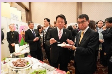
Akaushi Beef tasting