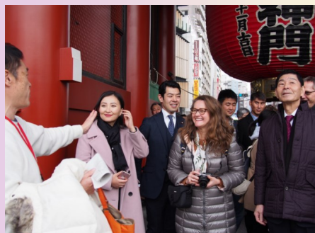
Stroll around Senso-ji Temple