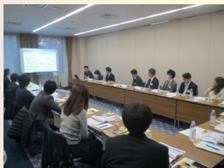
Sectional meeting session