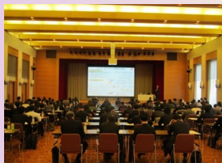
Diplomatic policy briefing session