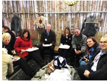
Lip-smacking seafood at Ama divers' hut

The Ministry and four municipalities (the cities of Ise, Shima, Toba, and Minami-Ise Town) co-hosted Diplomat's Study Tour to Ise-Shima Area. 19 Participants from 12 countries and one delegation enjoyed the Area's such attractions as food natural landscape, history and culture by visiting Ise Grand Shrine and other sites.