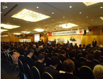
Commemoration ceremony to welcome delegation from Zhejiang Province