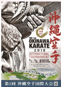
Poster of Okinawa Karate International Tournament