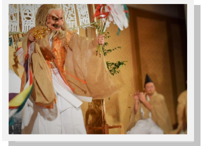
A Kagura performance at the Regional Promotion Seminar on December 11, 2017