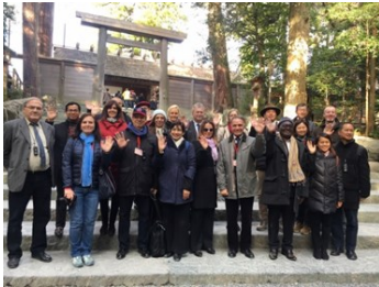
Inner Shrine, Ise Grand Shrine