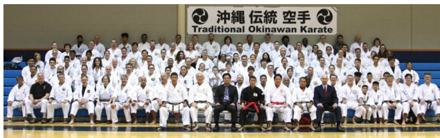
Okinawa Karate Seminar held at Washington D.C.

Okinawa Prefecture opened a karate promotion division in the Department of Culture, Tourism and Sports last April, and decided to organize the first Okinawa Karate International Tournament in August 2018. The Prefecture dispatched Okinawa Karate masters to three U.S. cities and held karate seminars and briefing sessions on the forthcoming tournament there.