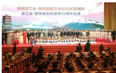
Commemoration Ceremony to welcome delegation from Shizuoka Prefecture

Shizuoka Prefecture and Zhejiang Province, People's Republic of China, held a series of commemorative events throughout 2017 to celebrate 35-year anniversary of signing the friendship pact. They have been maintaining interactions with each other in a variety of fields since 1977, which is the 10th anniversary of normalization of diplomatic relations between Japan and China.