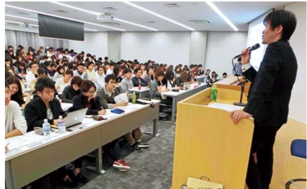
A MOFA official delivers a lecture under the theme of "International Cooperation as a Profession – From the Viewpoint of Practical Diplomacy" to approximately 500 students of the Faculty of Law, Hosei University in October 2016.

Security Projects and Cultural Grant Assistance projects, including projects which proved to be effective as well as those which proved to be deficient, in order to promote more effective implementation of ODA. Since FY2014, some of the information in these lists has been integrated into each project's page on JICA's ODA Mieru-ka Site in an effort to further increase convenience.