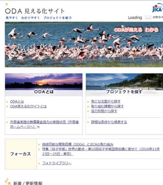
The ODA Mieru-ka Site. (a website for the visualization of ODA)

to report on Japan’s cooperation. Furthermore, Japanese diplomatic missions host various lectures and create websites, PR pamphlets, and other sources of information both in English and local languages.