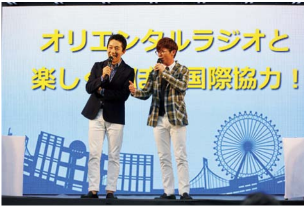
“Oriental Radio,” a popular comedy duo in Japan, introduces international cooperation at the GLOBAL FESTA JAPAN held in Odaiba, Tokyo in October 2016.

named as a “Treasure of Japan,” and many “treasures” which were rooted in and appreciated in regions around the world were presented. Furthermore, the program presented how the development cooperation projects are implemented in regions around the world and explained about the significance of providing development cooperation. Aside from TV programs, information on development cooperation was disseminated to the public through various media, including newspapers and websites.