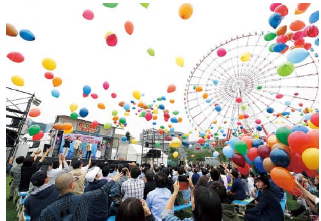
The opening ceremony of GLOBAL FESTA JAPAN

to report on Japan’s cooperation. Furthermore, Japanese diplomatic missions host various lectures and create websites, PR pamphlets, and other sources of information both in English and local languages.