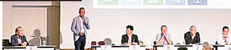
“International Forum for Sustainable Asia and the Pacific” (ISAP2016)