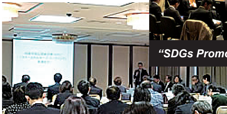
“SDGs Stakeholder’s Meeting” (Hosted by MOE and IGES)