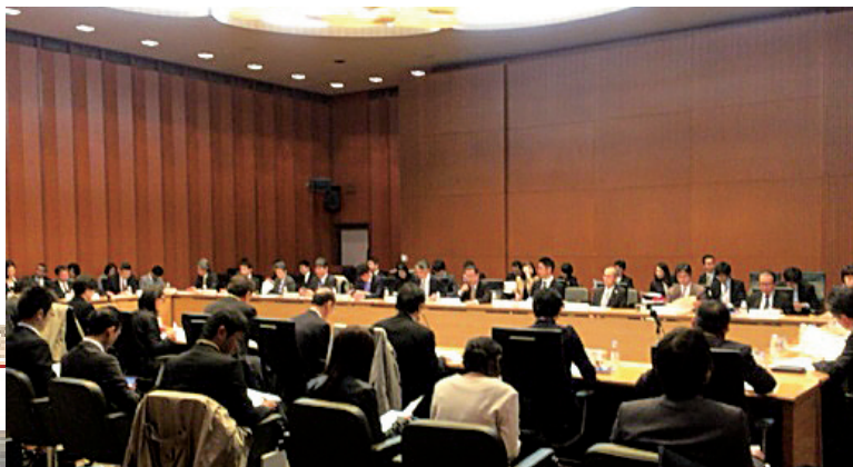
“SDGs Promotion Roundtable Meeting”