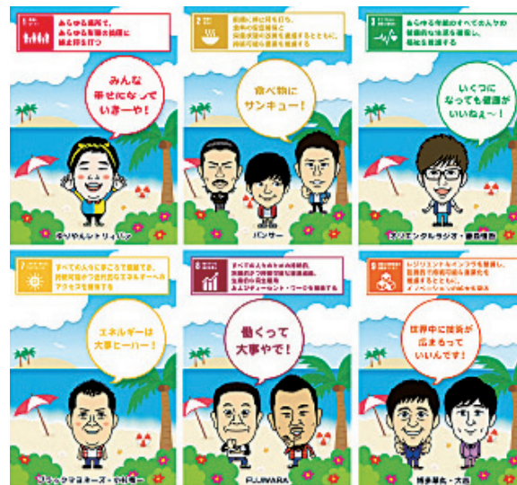
That's right! We can do it! SDGs Stamp Rally