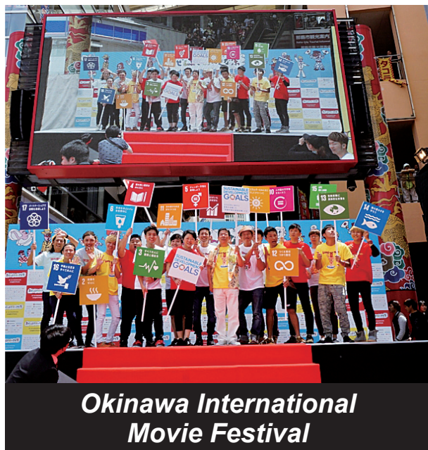
Okinawa International Movie Festival