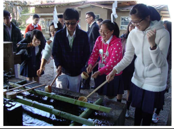
11/20 【Historical Landmark】 Nasu Shrine (Ohtawara City)