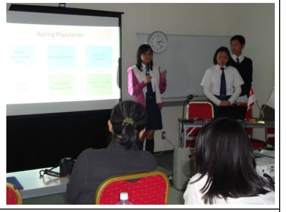
11/23 【Reporting Session】(Tokyo)