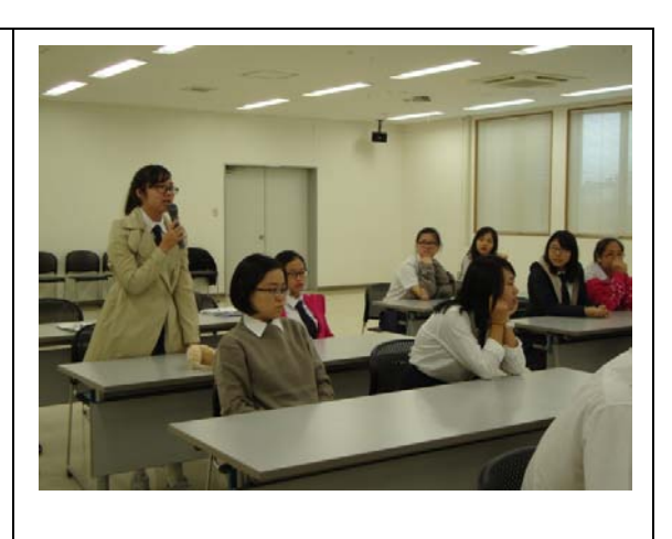
11/20 【Curtesy Call】 Ohtawara City Office (Ohtawara City)