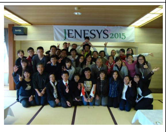
11/22 【Homestay】 Farewell Party with Host Family (Ohtawara City)