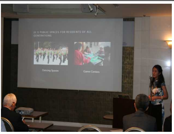
25<sup>th</sup> August, the Presentations of the policy recommendations by groups