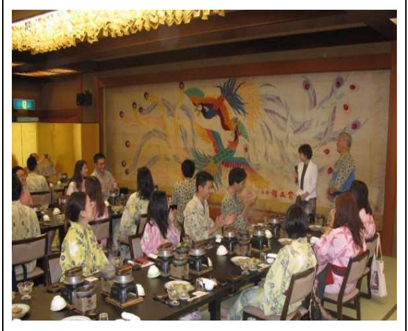
23<sup>rd</sup> August, the Japanese cultural experience (Hot spring and Yukata)