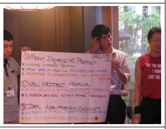
24^{\mathrm{th}} August, the group discussion