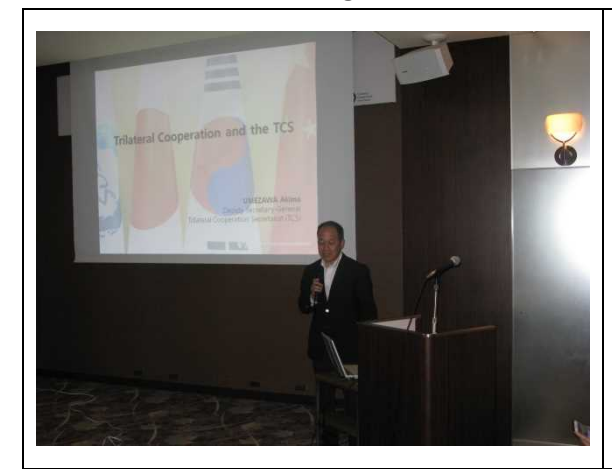
22<sup>nd</sup>August, the Lecture by Trilateral Cooperation Secretariat