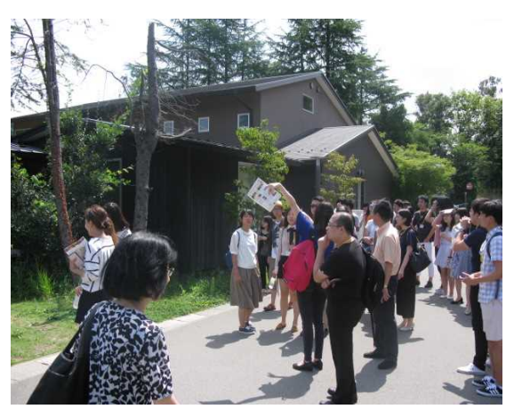
24^{\rm th} August, Visit to Share Kanazawa