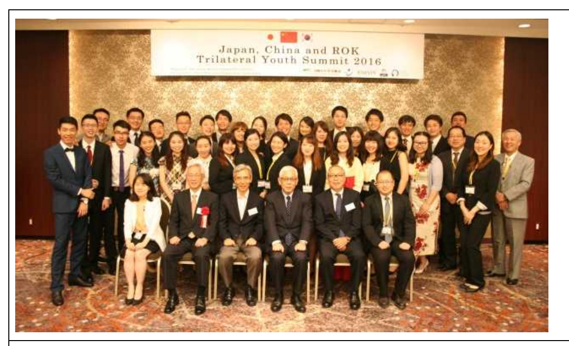
25th August, Photo session of the Students, the guests and related persons