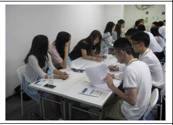
23<sup>rd</sup> August, the discussion of the low birthrate and longevity problem