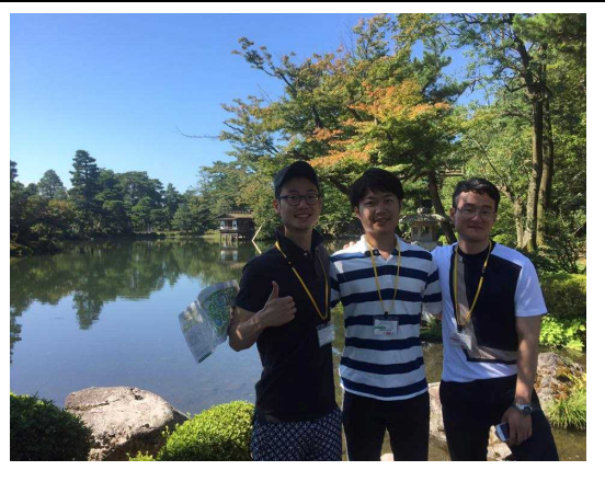
25^{\mathrm{th}} August, Visit to Kenrokuen