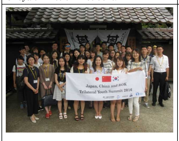
24<sup>th</sup> August, Visit to Gyozen-ji