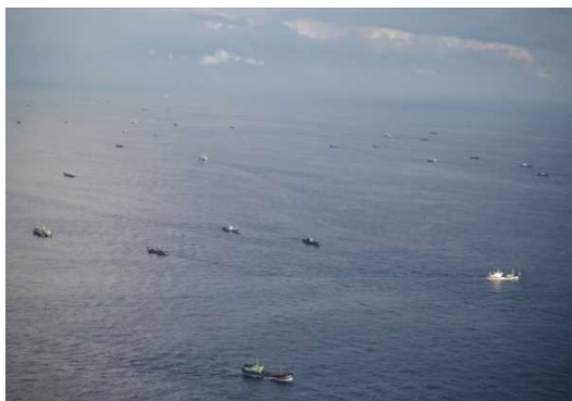
Swarm of Chinese fishing vessels

There are usually around three Chinese government vessels deployed in the contiguous zone of the Senkaku Islands, and four or five Chinese government vessels deployed in the area surrounding the Scarborough Shoal in the South China Sea. The number of Chinese government vessels deployed to the area around the Senkaku Islands was far higher than the numbers above.