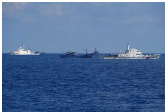
Chinese government vessels and fishing vessels