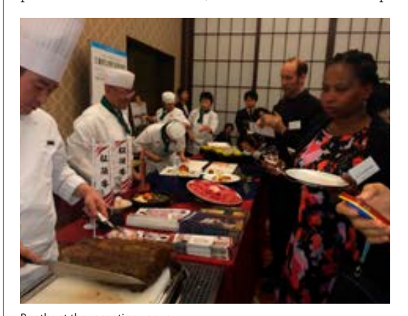
Booths at the reception venue (Reception co-hosted with Governor of Mie Prefecture, October 27)

Furthermore, MOFA actively provides local governments with opportunities to explain things such as Japan's current diplomatic policies, etc., and exchange views. As a part of such activities, a "Local Partnership