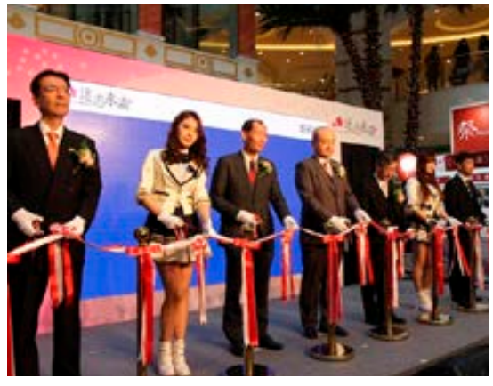
The local promotion project in Shanghai, launched to recover reputational damages