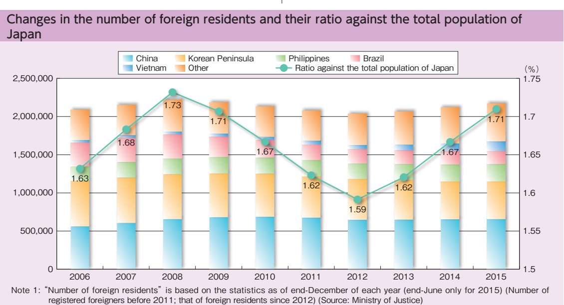
Note 2: "Ratio against the total population of Japan" is calculated based on the population as of October 1 of each year according to the "Census" and "Population Statistics" of the Statistic Bureau, Ministry of Internal Affairs and Communications.

During Disaster Prevention Week in September, MOFA organized "Seminar Disaster Prevention Measures the Diplomatic Corps," based on the lessons learned from the Great East Japan Earthquake. With the participation of local governments, their relevant organizations and private institutions, as well as the Ministry of Internal Affairs and Communications (MIC) and the Japan Tourist Agency, the seminar introduced the efforts using IT of the relevant organizations such as on the development of a smartphone application for the safety confirmation of missing foreign nationals in Japan and information provision.