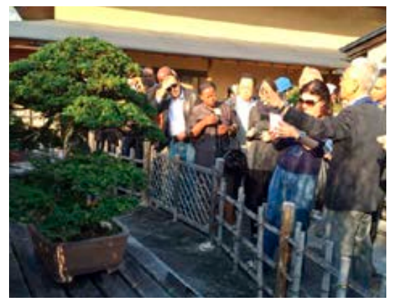
Diplomats' Study Tour (Saitama City): at the Omiya Bonsai Art Museum,

Cooperation Forum" was held in January. Part 1 of the forum was the foreign policy briefing session, where MOFA explained how to transmit information strategically outside the country. In Part 2 of the forum, participants exchanged views in four sectional meetings titled "information transmission to the world by municipalities making use of foreign media", "regional vitalization and showcasing local attractions by attracting foreign tourists, in particular, from ASEAN and Muslim nations," "promoting cultural exchanges," and "assistance for overseas business expansion of Japanese companies and local public entities through public-private partnerships." About 130 people, mainly local government officials, attended the forum.