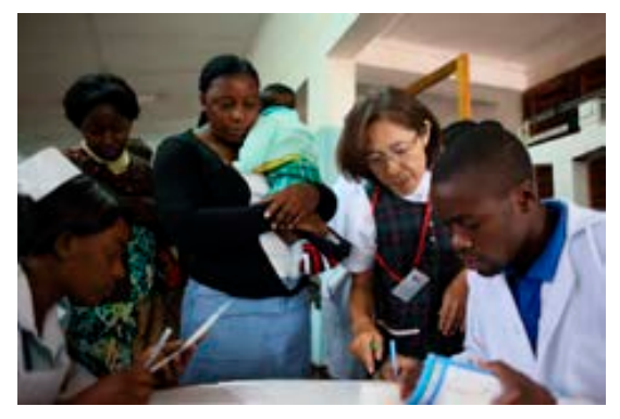
A member from the Senior Volunteers (SV) working as nurses at a maternal and child health center in Zambia

JOCV and SV programs are supported by the high aspirations of people who are keen to provide cooperation for the sake of economic and social development and reconstruction of developing countries. MOFA actively promotes these programs, considering them as a core of participatory international cooperation by citizens. As of end-November 2015, 2,114 JOCVs and 442 SVs are working around the world (71 countries and 59 countries, respectively). The volunteer participants who have returned to Japan contribute their experience to Japanese society by sharing their experiences in educational and local activity settings and private companies. These unique participatory activities of Japan are highly