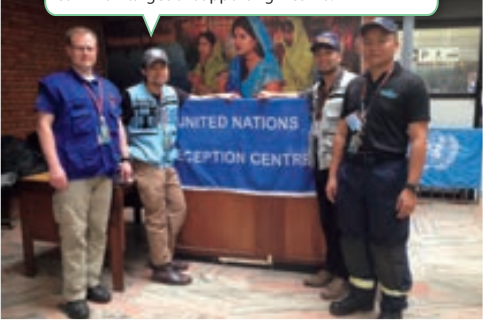
Establishing a Reception Departure Centre at an airport to respond to the earthquake in Nepal.

One of the attractive points of my job is contributing through the coordination of organizations such as various national governments and NGOs under a common target of supporting victims.