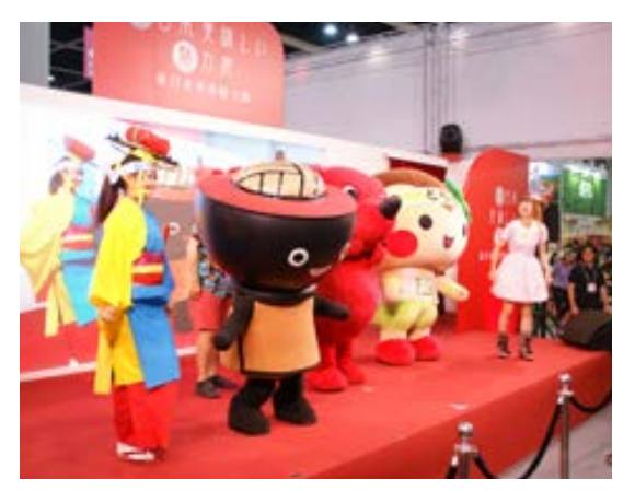
The local promotion project in Hong Kong, launched to recover reputational damages

Outside Japan, a new scheme was launched in 2015 to assist in recovering reputational damages. This is a comprehensive PR project to support the recovery and regional revitalization of disaster-stricken areas by countering unfounded rumors circulated worldwide following the Great East Japan Earthquake and by showcasing regional attractions as well as providing accurate information on food safety and other concerns through the cooperation and participation of local governments, plagued by unfounded rumors and import restrictions imposed on food produced in certain prefectures in Japan. First of all, in August in Hong Kong, the Japanese Booth "Delicacies of Eastern Japan" exhibition was set up at Hong Kong Food Expo