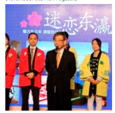
The author greeting at the closing ceremony of Local Promotion project for recovering reputational damages overseas (Shanghai)

contact for enquiries from foreigners, and to gather information about interests and needs for Japanese local areas.