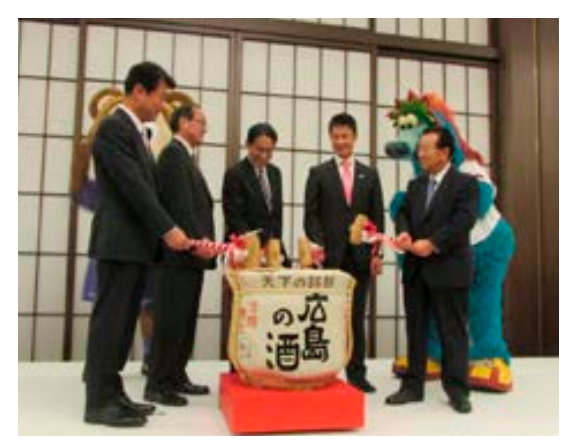
Kagami-Biraki, opening a cask of Japanese sake (Reception co-hosted with Governor of Hiroshima Prefecture and Mayor of Hiroshima, July 23)

Besides, "Regional Promotion Seminars" and "Diplomats' Study Tours" were also organized for the diplomatic corps in Tokyo. In July, MOFA co-hosted the 18th "Regional Promotion Seminar" together with Matsudo City and Chiba Prefecture, Sagamihara City and Kanagawa Prefecture, Saitama City, Toyota City (Aichi Prefecture), and Mitake Town (Gifu Prefecture) to promote their respective attractions and invited 75 people from diplomatic corps in Tokyo and other organizations. At the seminars, participating local governmental units introduced their latest information and products to the diplomatic corps, exchanged opinions and interacted with one another, over food and