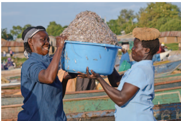
A resident of a fishing village in Siaya County in western Kenya helping a fellow worker put on his head a tub piled high with small fish called omena.

At the TICAD V Ministerial Meeting held in Cameroon in May 2014, Japan reported on the steadfast implementation of Japan's assistance pledged at TICAD V, and many African countries highly appreciated Japan's assistance thus far. By September 2015, for example, approximately 470 young people from Africa have entered Master's programs at Japanese universities, under the African Business Education Initiative for Youth (ABE Initiative), 8 which is aimed at training industrial human