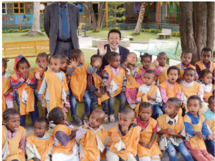
Parliamentary Vice-Minister for Foreign Affairs Hitoshi Kikawada visits the Selam Children Village in Ethiopia, supported by Japan, in December, 2015.

(ii) “Accelerating infrastructure and capacity development