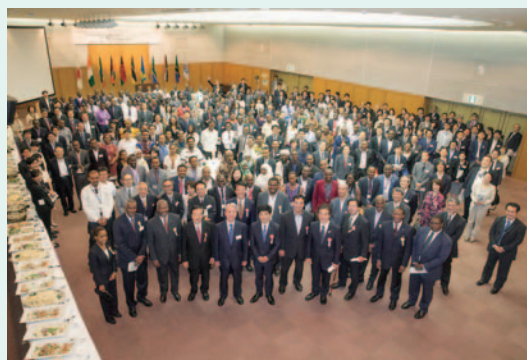
A total of 365 people participated in an “Encouragement Rally,” including representatives of the African embassies, guests from the Government of Japan, universities, and companies.

The companies accepting interns have also said that they benefited from hosting the interns. For example, it helped them obtain useful information for their business, establish beneficial business contacts, and globalize their workplace. It is hoped that these Japanese companies and African youth will help bridge Japan and Africa, and support Africa's future socioeconomic development. (As of September 2015)