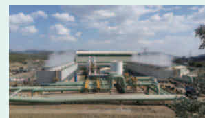
Olkaria Geothermal Power Plant.

Japan's loan aid is expected to help Kenya to generate a stable power supply. This will in turn contribute to the country's economic development. In addition, geothermal power is a form of renewable energy, and produces less air pollution and CO 2 emissions than a similarly-sized thermal power station. Therefore, the global environmental impact will also be reduced. (As of August 2015)