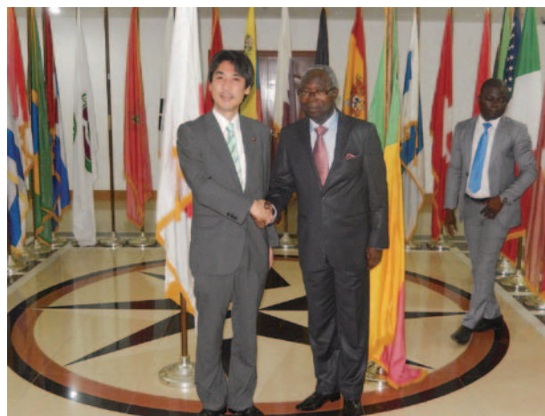
Then State Minister for Foreign Affairs Minoru Kiuchi meets with Minister for Foreign Affairs, African Integration, Francophonie and Beninese in Diaspora Saliou Akadiri in August 2015.

Japan will continue to steadily carry out assistance that is wide-ranging and unique to Japan in areas such as economic growth involving private investment, development, and peace and stability, while taking into