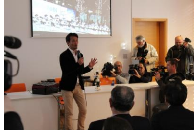
Lecture at University of Split