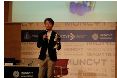
Lecture at the National Museum of Science and Technology in Alcobendas