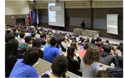
Lecture at University of Zagreb