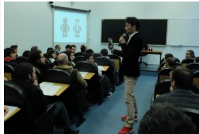
Lecture at Autonomous University of Madrid