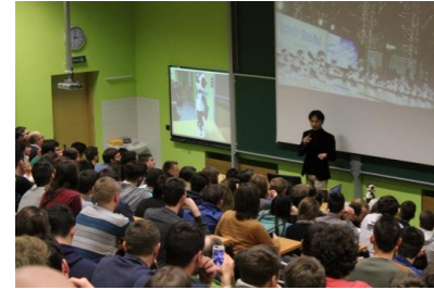
Lecture at University of Rijeka