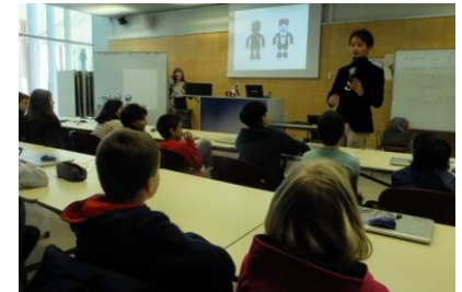
Lecture for children at the National Museum of Science and Technology in Alcobendas