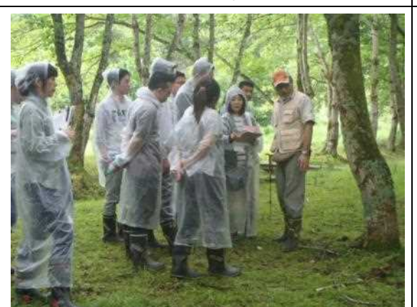
6/27 [Observation ] Kutsuki Forest (Takashima City)