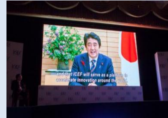
Opening Video Message from Prime Minister Shinzo Abe

Participants : About 800 policymakers, business leaders and researchers from as many as 80 countries and regions participated.