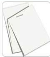
Sea area monitoring (Weekly report)