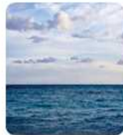
Sea area monitoring