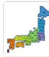
Monitoring by prefecture