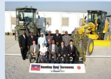
Handing Over Ceremony 18 December 2013