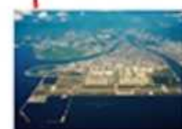
Marine Corps Air Station Iwakuni