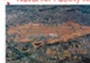
Naval Air Facility Atsugi

* In the "2+2" Joint Statement of April 2012, Japan and the U.S. decided to delink both the relocation of U.S. Marine Corps personnel from Okinawa to Guam and land returns south of Kadena from progress on the relocations of MCAS Futenma.