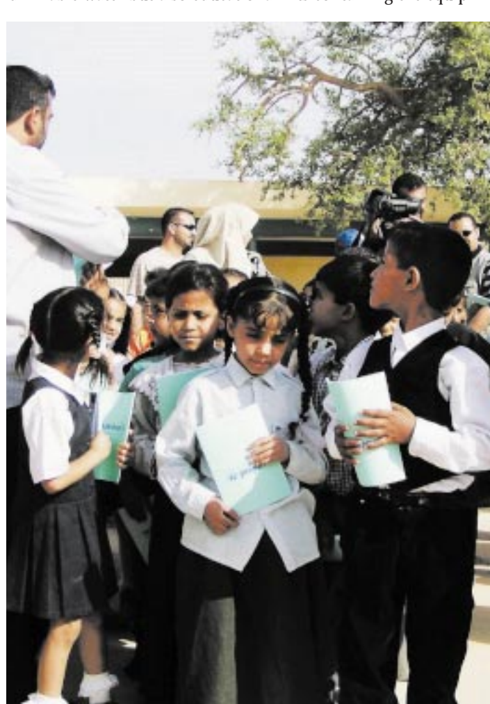
UNICEF workers distribute school supplies.

The continuation of education is indispensable to the sound development and mental stability of children. The Government of Japan has thus worked through UNICEF to provide the war-affected children of Iraq with not only medical supplies and drinkable water but also educational kits containing the equip-