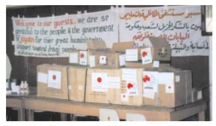
Medical supplies distributed in cooperation with HAJCO

The Government of Japan has donated approximately $150,000 to support a project by the Hashemite Jordan Charity Organization (HAJCO), an NGO based in Jordan. The purpose of the project is to transport and distribute medical supplies, including antibiotics and other pharmaceuticals, as well as gauze and sutures, in Iraq. The medical supplies are being used to help the people of Iraq at Al-Kadhimiya Teaching Hospital in Baghdad.