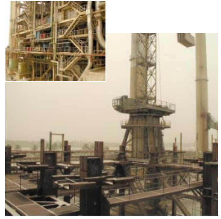
Hartha Power Station

Al-Kadhimiya Teaching Hospital is one of the largest hospitals in Baghdad and was originally built with assistance from Japan. The Government of Japan provided approximately $3.6 million to the UNDP to repair its facilities and to furnish medical equipment and supplies.