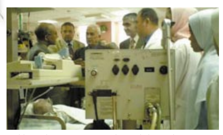
Workshops involving Japanese, Egyptian, and Iraqi medical personnel in Cairo.

The Government of Japan is cooperating with Egypt to restore medical services in Iraq. Activities include the dispatch of a Japan-Egypt joint medical survey team to Baghdad, the hosting of workshops for Japanese, Egyptian, and Iraqi medical personnel in Cairo and Tokyo, and the training of Iraqi personnel at medical institutions in Egypt, especially Cairo University. Priority is given to human resources development in high-need fields, such as pediatric medicine. Some 215 Iraqi medical personnel have received training.