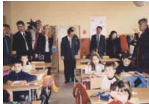
An Elementary School in Mitrovica, restored through Grassroots/Human Security Grant Aid

Since the national economy of Serbia and Montenegro has been devastated by the prolonged conflicts and following economic sanction, the government is currently unable to provide enough support in repairing destroyed or degraded educational facilities. Located within the industrial city, Ribnica Village is experiencing rapid population growth. Sveti Sava Elementary School is facing a sharp rise in its number of students as a consequence, accelerated by accepting numerous Kosovo IDP pupils. Students are forced to endure their classes under harsh conditions with their school building degraded and heating instruments not functioning during severe winter. Japan has supported the restoration of the school building to improve educational environment and through this kind of contributions in the education sector, it has helped to promote ethnic reconciliation. Furthermore, Japan has assisted school restoration and provided educational equipments to 29 other elementary schools in Serbia and Montenegro with same kind of problems in order to improve the quality of basic education.