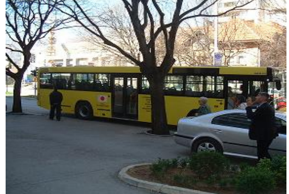
A “Yellow Bus” provided through Japan’s grant-aid in Sarajevo.

Sarajevo has been exposed to the continuous gunfire in 4 years of conflict resulting in the devastating destruction of public facilities, affecting people’s life seriously. Public transportation system in Sarajevo has also suffered a major damage and above all, the number of public bus, a daily transportation means among the citizens, has declined to one fifth of the pre-conflict time. Under such circumstances, a total of 80 buses have been granted for the reconstruction of bus routes in order to ensure stable civil life, to activate economic activities and to secure transportation means of conflict affected people to visit hospitals. As a symbol of peace achieved by overcoming the conflict damage, a “yellow bus” is circulating the town of Sarajevo today.