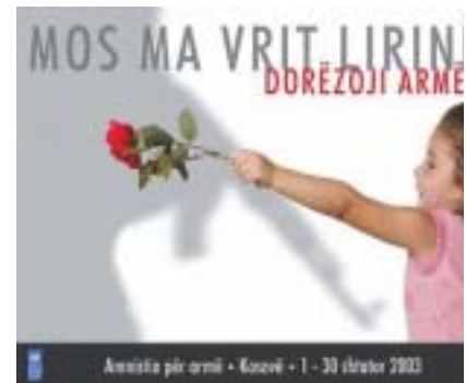
A poster of UNDP “Small Arms Recovery Plan” “Don’t kill my freedom”

Japan has assisted the total of 186.75 million US dollars to Kosovo. Through international organizations and NGOs this humanitarian and reconstruction assistance has been devoted into reconstruction of destroyed housing and educational facilities, media improvement, DDR (Disarmament, Demobilization and Reintegration) support and Moreover, to support the neighboring countries; Albania and FYRO Macedonia, which accepted the refugees escaping from the Kosovo Crisis, 62.63 million yen has been granted in two years in order to implement food assistance and medical equipment provision.