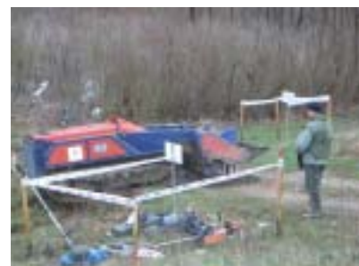
Support of equipments for the Croatia Mine Action Centre

Assistance totaling 910 million yen has been implemented to Bosnia and Herzegovina, Croatia and FYRO Macedonia through international organizations and NGOs. Removal of landmines and unexploded bombs and supports for rehabilitation, pain therapy and skill training for social reintegration of mine affected victims are conducted.