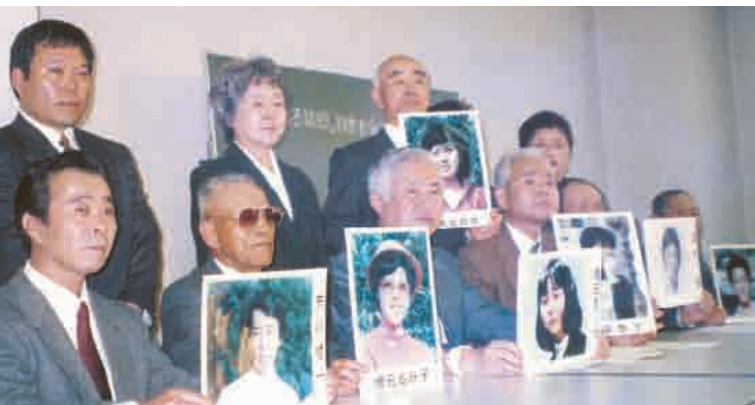
Association of the Families of Victims Kidnapped by North Korea was formed

During the 1970's and the 1980's, many Japanese citizens disappeared under strange circumstances. The investigations by the Japanese authorities and testimonies by defected North Korean agents revealed that, with a strong possibility, these cases involved