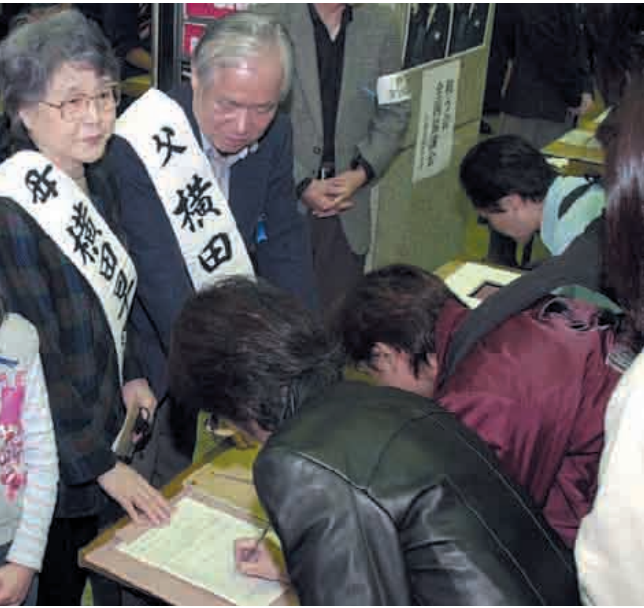
Association of the Families collecting signatures to gain public support

which is still being harbored in North Korea.