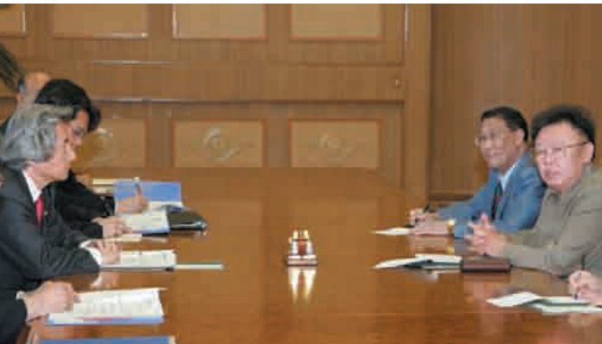
The Second Japan-DPRK Summit Meeting in Pyongyang on May 22, 2004