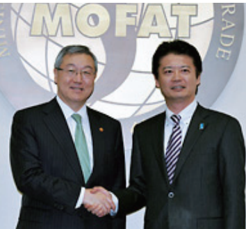
Japan-ROK Foreign Ministers' Meeting in October 2011

(2) Japan has also been raising the abduction issue in the Six-Party Talks. In fact, taking steps to normalize relations between Japan and North Korea, on the basis of the settlement of the abduction issues and other outstanding issues of concern, was set as one of the undertakings included in the September 2005 Joint Statement of the Six-Party Talks. Based on this, at the Six-Party Talks held in February 2007, a Working Group for the "Normalization of DPRK-Japan Relations" was established. At the Six-Party Talks