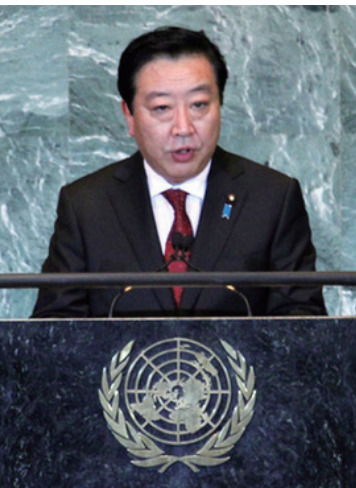
Prime Minister Noda giving a speech at the General Debate of the United Nations General Assembly (September 2011)