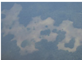
Rain forest in Gabon

This is a cooperation project between the Research Institute of Tropical Ecology of Gabon and Kyoto University together with Yamaguchi Univ. and Chubu Gakuin Univ., with assistance from the SATREPS programme in coordination with JICA and JST. In order to prevent rapid decline of biodiversity, the project aims to conduct monitoring of keystone and umbrella species to understand their seasonal changes. Based on these