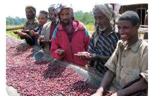
Harvest of forest coffee