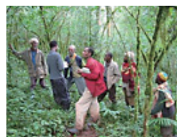
Forest management by local people

The government of Ethiopia, with JICA's technical assistance, is implementing a participatory forest management project. The project contributes not only to forest conservation but also to the improvement of living standards through the commercialization of forest coffee which is exported to Japan by UCC (Ueshima Coffee Co., Ltd.).