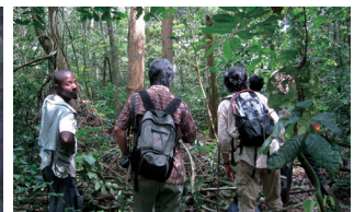
Moukalaba-Doudou National Park