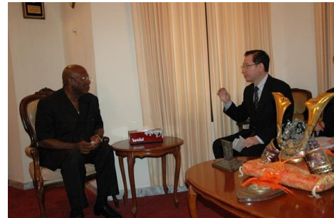
Meeting with President Kabbah