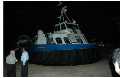
Hovercraft connecting Freetown with Lungi Airport

with very uneven surfaces and no street lights to provide illumination at night. Such conditions would undoubtedly discourage visits by potential business investors and tourists from the rest of the world. Another prominent example of the deficiency of infrastructure was the lack of electricity. When I had a meeting in the Foreign Ministry in Freetown, the uninterrupted noise of generators outside the building constantly interfered with our conversation. In this connection, it is worth mentioning an observation made by government officials on that occasion. They pointed out that, even if former soldiers have been successfully disarmed and demobilized, it is too difficult and expensive for the Government to obtain enough generators to guarantee decent lives and jobs for those demobilized. The lack of adequate infrastructure thus is not only an economic concern but also a potential security threat.