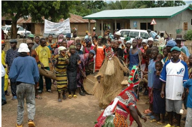
Welcome dance by village residents

32. In the broader perspective on capacity-building, empowerment of communities in rural provinces is also essential. I visited a village on the outskirts of Makeni, the capital of the Northern Province, where a community empowerment project organized by UNDP and funded by the Government of Japan was being implemented under the concept of “weapons for development.” Through the various events in the village, I was quite impressed by the high degree of energy and solidarity of the members of the community under the leadership of their paramount chief.