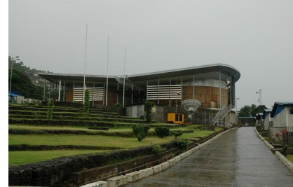
Special Court buildings

26. The second urgent issue in the area of justice sector reform relates to the support for the work of the Special Court for Sierra Leone (SCSL). The Court launched many groundbreaking initiatives upon its establishment, including its own hybrid nature, combining domestic and international characteristics, and the selection of a trial venue in the country where the crimes were committed. The Court is planning to finalize its work by the end of 2009 and, in addition to its core task of conducting the trials in both Freetown and The Hague, it is implementing so-called “legacy” programs in order to promote understanding among the local people regarding legal matters, with a view to strengthening the domestic judicial system in Sierra Leone. In that sense, the SCSL is contributing to justice sector reform of the country through its activities. At the same time, as the Court is currently facing a serious shortage in the funds for its activities, some kind of financial arrangement needs to be considered on an urgent basis.