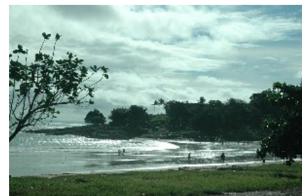
Beautiful beach at the shores of Freetown