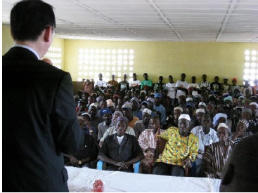
Speech at a community gathering in Makeni

34. In terms of administrative capacity, the Government of Sierra Leone should identify specific needs for the capacity-building of civil servants and, when appropriate and feasible, explore possibilities for South-South cooperation with appropriate donor assistance. At the community level, as mentioned above, while striving to preserve the traditions that exist in rural communities, enhanced participation by women and youth in community activities such as decision-making should be encouraged through able and innovative leadership by the paramount chiefs.