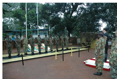
Inspection of soldiers at military barracks in Freetown

23. In Freetown, I had an opportunity to visit the Barrack Services Maintenance Unit Headquarters in the Wilberforce area escorted by military commanders. The living conditions in the barracks were much harsher than I had imagined. After inspecting the Guards of Honor of the Republic of Sierra Leone Armed Forces (RSLAF), I was guided to the office of the commanders, where no electricity was provided and no lights were shining. Meanwhile, the most urgent needs in the barracks compound were clearly water and sanitation. Pipes were exposed everywhere, and the water supply system thus was not reliable. The sanitary situation was far from satisfactory, and the threat to the health conditions of those residing in the barracks, including many children, must be regarded as a matter of serious concern. In this regard, it is encouraging that the PBF approved on 11 July utilization of approximately $US 2 million for an assistance project entitled "Rehabilitation of the water and sanitation facilities for the RSLAF barracks in Freetown," the targets of which included the compound I visited. However, as the project is intended only for initial renovation, there is an urgent need to follow up the project to ensure that conditions will at least meet minimum standards.