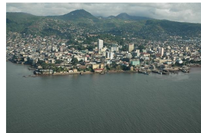
Aerial view of Freetown

A mission by a Japanese delegation to the Republic of Sierra Leone took place from 30 July to 4 August 2007. The main objectives of the mission were (a) to observe the status of the preparations for the presidential and parliamentary elections in Sierra Leone scheduled for 11 August 2007 and, in order to encourage their smooth and successful conduct, hold discussions with national and international stakeholders; (b) to assess at first hand specific needs and gaps in peacebuilding priorities in Sierra Leone following Japan's inauguration as the chair country of the UN Peacebuilding Commission in June, with a view to the practical and productive development of an integrated peacebuilding strategy for Sierra Leone; and (c) to explore the future possibility of Japan's further contribution to the consolidation of peace and development in Sierra Leone.