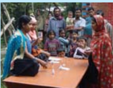
"Poly-Glu" Ladies at work in Bangladesh