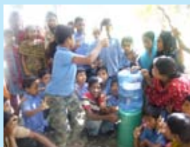
Children gathered around Poly-Glu water in Bangladesh