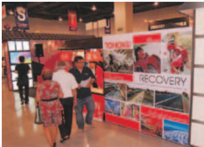
Japan booth at a sightseeing exhibition (February 2012, Philippines)

The Ministry invites international opinion leaders, journalists, other leaders and promising individuals who are likely to attain future leadership positions in order to deepen their understanding of Japan. The Ministry also supports the participation of Japanese intellectuals in international conferences to strengthen the representation by Japanese experts. Furthermore, the Ministry organizes Exchange Year programs that commemorate diplomatic anniversaries with other countries and in 2011 exchange activities were extendedly held in Germany, Kuwait, and the three Baltic states. Japan is providing international contributions in the area of culture, including the preservation and restoration of cultural properties and training of specialists, through provision of cultural grant assistance for developing countries, and cooperation with the United Nations Educational, Scientific and Cultural Organization (UNESCO) and other international organizations.