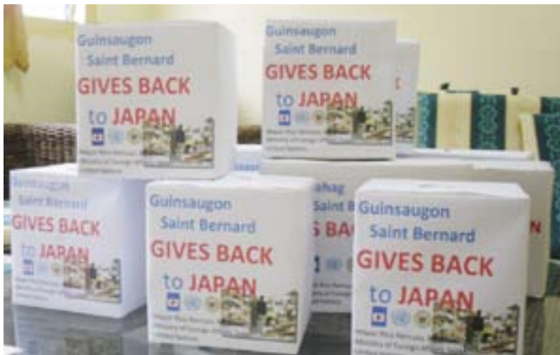
Saint Bernard Town (Southern Leyte, hit by massive mudslide in 2006) started fund-raising activities to return the favor to Japan which gave assistance to the town after the disaster in 2006. “The amount may be small, but we want to show our gratitude to Japan”, the mayor says. (Philippines)

implementation of its international commitments regarding ODA. Japan has steadily been fulfilling the international commitment it has made, including the efforts toward achieving the Millennium Development Goals (MDGs) by the deadline of 2015; supporting the African region where MDGs efforts are behind schedule; and assistance to Afghanistan and Pakistan, both of which are very important to peace and stability of the international community.