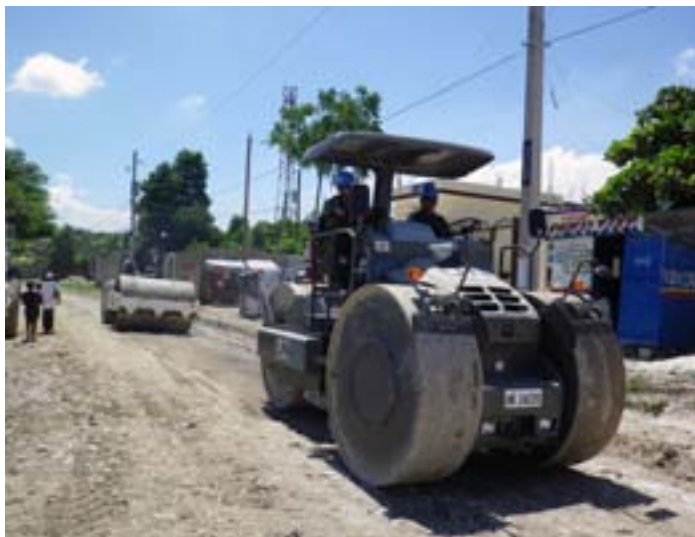
Operation by Self-Defense Forces engineering unit dispatched to United Nations Stabilization Mission in Haiti (MINUSTAH) since 2010 (Haiti)

For Example, Japan has actively participated in international efforts to maintain peace and stability such as the United Nations Peacekeeping Operations (PKO). In conflict regions, Japan is addressing peacebuilding as one of its major diplomatic issues, which is the seamless efforts ranging from the promotion of peace processes and emergency humanitarian assistance in the immediate aftermath of conflicts to security maintenance, reconstruction and long term development, while also paying attention to prevent conflict recurrence and to build the foundation for development towards sustainable peace. Japan's peacekeeping and peacebuilding efforts include contribution to the United Nations (UN) PKO, field efforts by utilizing Official Development Assistance (ODA), efforts at the UN and human resources development.