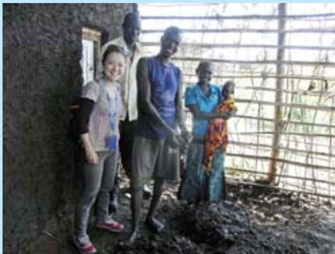
The shelter project for returnees in Central Equatoria State