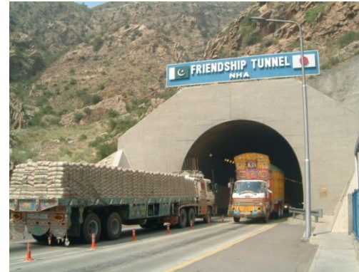
(Kohat tunnel, Northern part of the Indus Highway)

Japan has supported development of infrastructure in Pakistan through Japanese ODA loans in such areas as transport and energy. Among them, the "Indus Highway Projects" is especially a symbol of friendship between the two countries. After the earthquake in 2005, Japan provided the Emergency Earthquake loan amounting to 11.2 billion yen. Recently, in May 2008, four new Japanese ODA loans amounting to about 47.9 billion yen were extended. As a result, the accumulated total amount of Japanese ODA loans to Pakistan since 1961 adds up to about 928.0 billion yen.