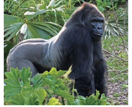
Golliras are protected under the CITES