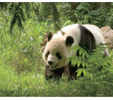
Giant Pandas are also protected under the CITES