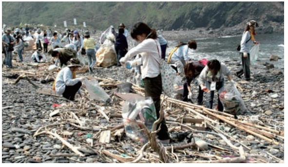
Students collect garbage thrown up on the shore in Tsushima City. Nagasaki

Japan discusses environmental policy through bilateral consultations such as joint committees on environmental protection with South Korea, China, and Russia, and through multilateral frameworks among Japan, China, South Korea, and other countries.