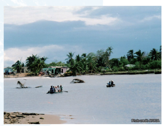
There is a possibility that many disasters are occurring due to climate change. (Photo: Japan Center for Climate Change Actions (http://www.jccca.org/))

Source : IEA(2009) "CO2 Emissions from Fossil Fuel Combustion"