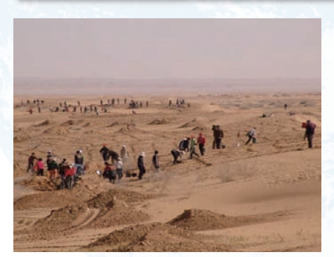
Afforestation project in China (Japan International Cooperation Agency, JICA)

Combatting desertification requires multi-faceted measures that take into consideration poverty and food problems in developing countries and other factors.