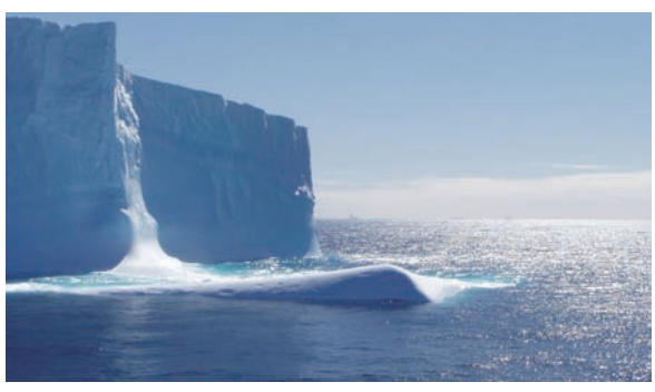
Icebergs have started to melt in Antarctica.

The Antarctic Treaty came into force in 1961 and stipulates peaceful use, freedom of scientific research, promotion of international cooperation, and freeze of claims to territorial sovereignty.