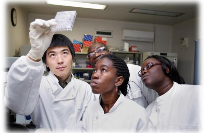
Research project using medicinal plants, Ghana

FOR THE FIRST TIME IN AFRICA, DO NOT MISS TICAD VI DATES: AUGUST 27-28 PLACE: KENYA