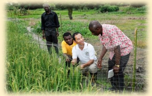
Project for Sustainable Development of Rain-fed Lowland Rice Production, Ghana