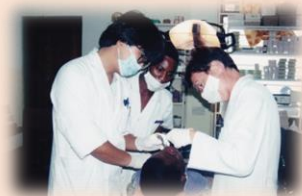
Ex-JOCVs (Japan Overseas Cooperation Volunteers)