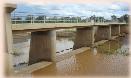
The Rehabilitation of Bwanje Irrigation Scheme

The Japanese grant aid started in 1979. This mostly supports the bilateral relationship between the Government of Japan and the Government of Malawi and other multinational schemes. Japan has implemented various projects including; the Rehabilitation of Bwanje Irrigation Scheme, the Improvement of Blantyre City Roads on Chipembere Highway, the Construction of Community Day Secondary Schools (CDSSs).