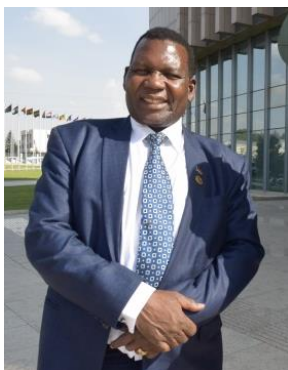
Hon. Dr. George T. Chaponda, M.P. Minister of Foreign Affairs and International Cooperation of the Republic of Malawi

Message from Hon. Dr. George T. Chaponda, M.P. Minister of Foreign Affairs and International Cooperation