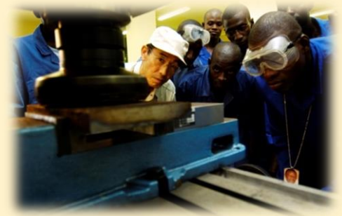
Job training center, Senegal

In the TICAD process, Japan has established follow-up mechanisms. For example, pledges are announced at the summit-level meetings, and the status of their implementations is confirmed at the ministerial meetings. African countries have highly acclaimed the steady assistance extended by Japan, a country that keeps its promises.