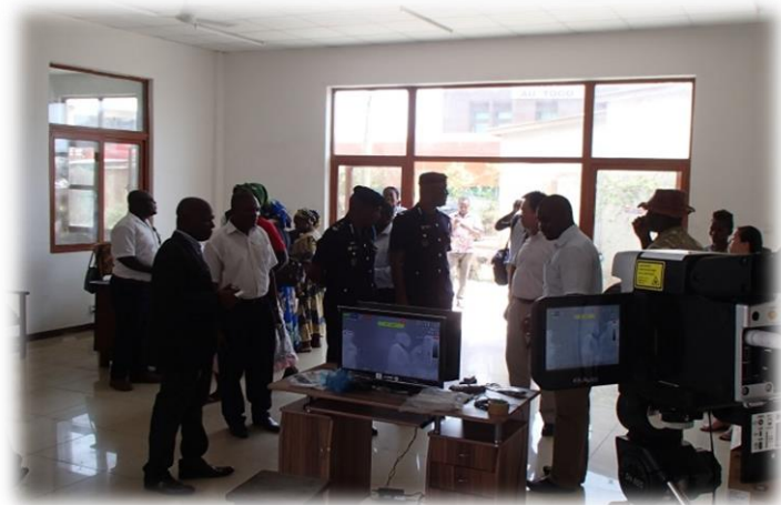
Thermographic camera demonstration, Ghana

The year 2016 will be a memorable year in which TICAD is being held for the first time in Africa, symbolising African ownership. The relationship between Japan and Africa is entering into a new phase in August 2016 with TICAD VI.