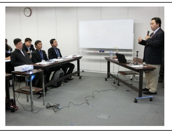
11/30 [Lecture on Theme-related Field] Japan International Cooperation Agency (JICA)