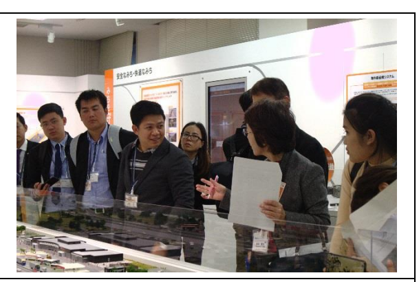
11/29 (Observation of Theme-related Facility) Central Nippon Expressway Company Ltd. (NEXCO Central)