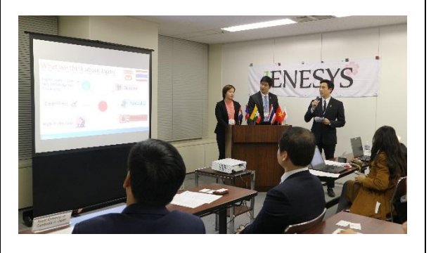
12/4 [Reporting Session]