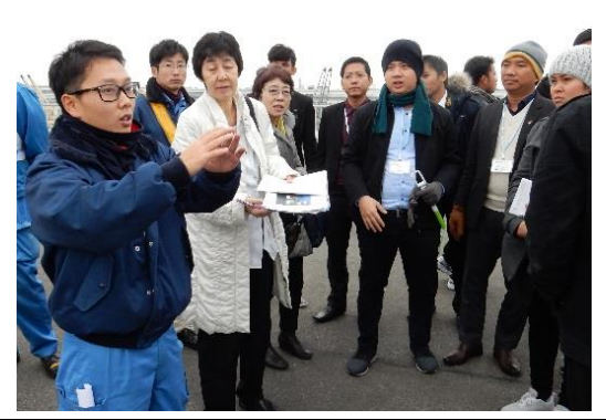
【Observation of Environment-related Facility】 SANKYU Inc.