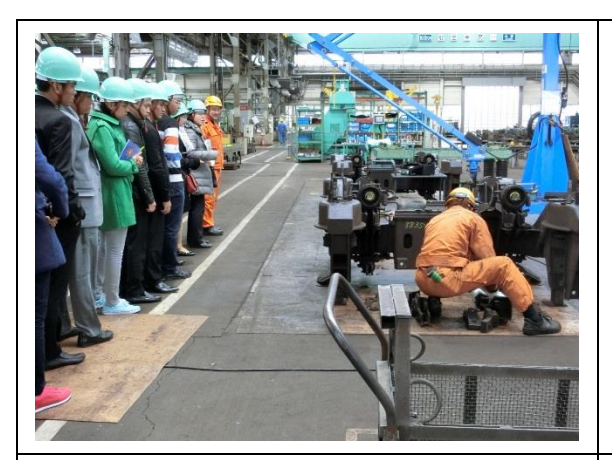
11/30 【Observation of Theme-related Facility】 Tokyu Corporation; Nagatsuta Rolling Stock Center