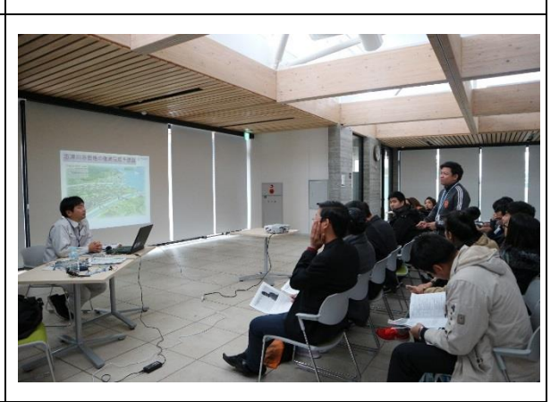
12/2/ [Lecture on the Region] Minamisanriku town