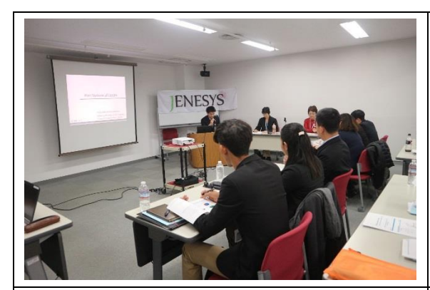
11/29 [Lecture on Japanese Culture/Key Note Lecture] Ministry of Land, Infrastructure, Transport and Tourism