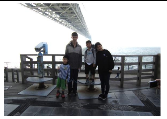
11/2[School Exchange]Kobe City College of11/3 [Homestay]Technology11/3 [Homestay]