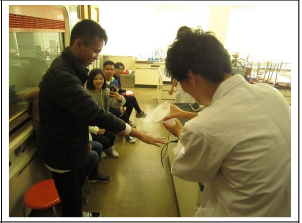
11/2[School Exchange]Kobe City College of Technology