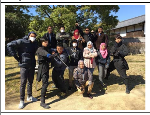
2/25 [Observation of Historical Landmark] Wakayama-jyo Castle (Wakayama City)