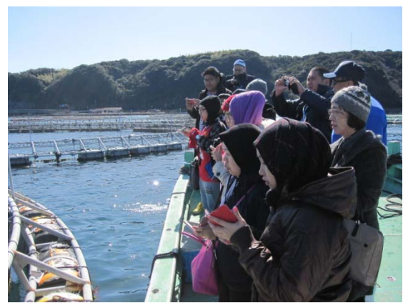
2/25 【Observation】 Fisheries Laboratory, Kinki University(Higashimuro District)