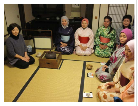
2/27 [Home stay] (Hidaka District)