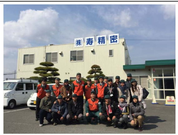
2/26 [Local Industry] KOTOBUKI Precision (Ito District)