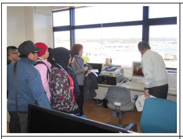
2/25 【 Observation/Lecture 】 Wakayama Prefectural Fisheries Experiment Station (Higashimuro District)