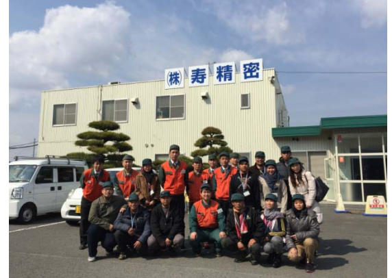
2/26 [Local Industry] KOTOBUKI Precision (Ito District)