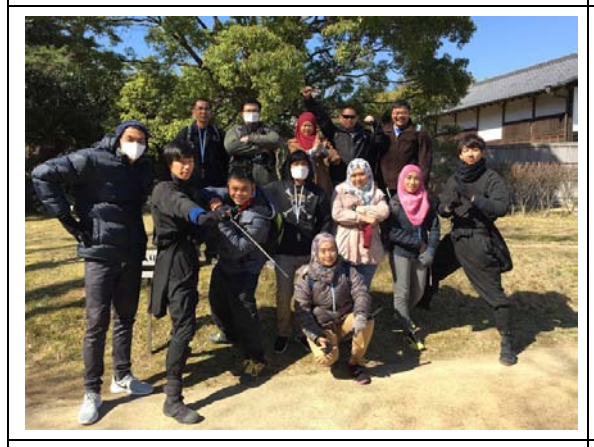
2/25 [Observation of Historical Landmark] Wakayama-jyo Castle (Wakayama City)