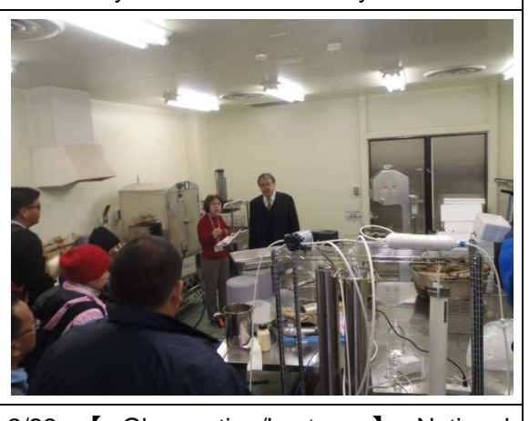
2/23 【 Observation 】 Kitajima Shibori Seisakusho Co., Ltd. (Tokyo)