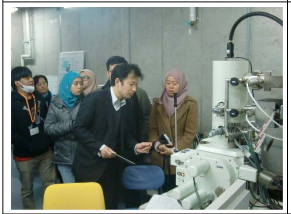
2/24 [School Exchange] Osaka Prefecture2/24University (Habikino city)Kind