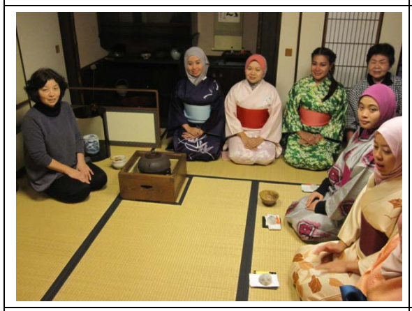
2/27 [Home stay] (Hidaka District)