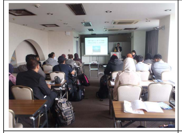
2/22 Program Orientation (Tokyo)