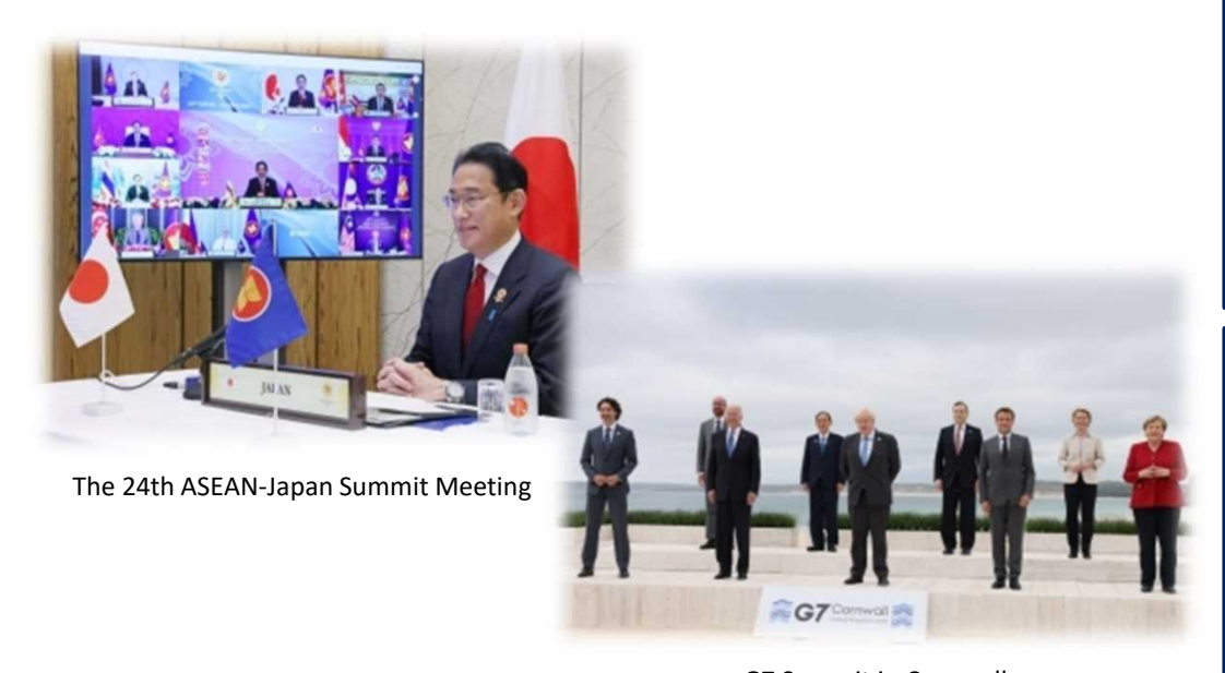
G7 Summit in Cornwall

The 24th ASEAN-Japan Summit Meeting (October 27, 2021) "We noted that both the AOIP and Japan's Free and Open Indo-Pacific (FOIP) concept share relevant fundamental principles in promoting peace and cooperation." (Chairman's Statement)