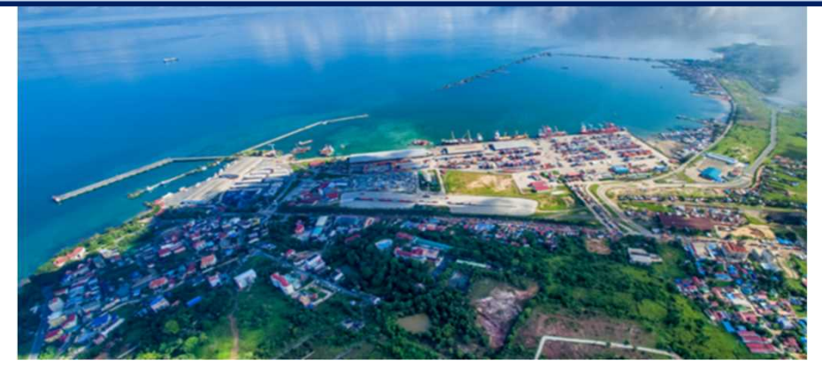
Sihanoukville Port in Cambodia

By enhancing hard and soft connectivity (\cancel{X}) within the region and providing options for the access to the Indo-Pacific ocean region, Japan supports to form a foundation which allows the region to develop economically together in an autonomous manner