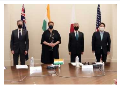
The Fourth Japan-Australia-India-U.S. (Quad) Foreign Ministers' Meeting