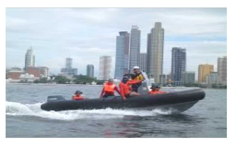
Technical guidance to the staff of the Philippine Coast Guard

<u>Providing equipment and human resource development for</u> maritime law enforcement in Southeast Asia