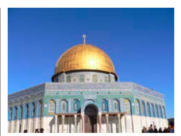
Dome of the Rock in "Haram al-Sharif"

The international community urged both Israel and Palestine to resume the negotiations at an early date. In particular, France called for forming an "International Support Group" in an attempt to break through the status quo the Middle East faces. Based on this attempt as well, the meeting of the enlarged Middle East Quartet was held at the time of the UN General Assembly in September. Foreign Minister Kishida attended this meeting as a