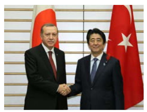
Japan-Turkey Summit Meeting (October 8,Tokyo)

have deteriorated. Turkey faces many problems, including the fight against ISIL and terrorists, accepting more than two million Syrian refugees as the largest host country in the world. After the downing of a Russian fighter jet in November 2015, tension with Russia has been increasing.