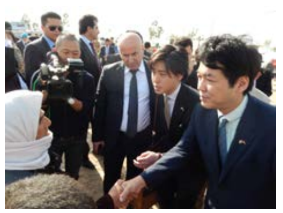
Parliamentary Vice-Minister for Foreign Affairs Sonoura, visiting a refugee camp at Baharka in the suburbs of Erbil and talking with internally displaced persons (March 15, Iraq)

Japan's experiences of democratization, peace and reconstruction has been shared with the members through the visits to Kyoto and Hiroshima in addition to the talks with government high-level official.