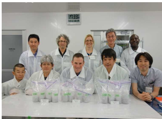
Implementation of the pre-processing of sediment required for the analysis and the resulting sets of identical samples prepared for independent analysis by each laboratory.