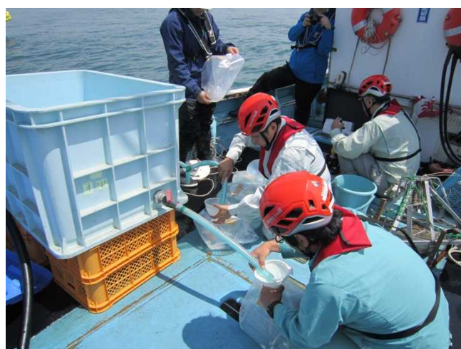
Distribution of surface seawater samples to each of the participating laboratories after collection and homogenization. The samples will subsequently be analyzed in parallel in Japan, the IAEA Environment Laboratories in Monaco, and two laboratories from the network of ALMERA.