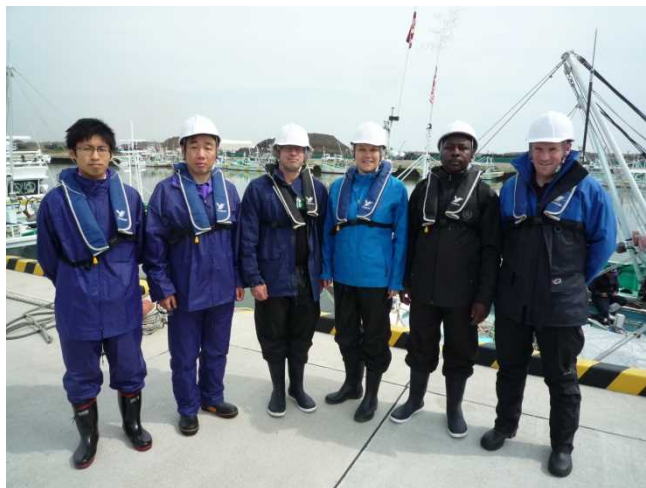
Members of the sampling mission from the Nuclear Regulation Authority (NRA), Ministry of Foreign Affairs (MOFA), IAEA and two experts from the network of Analytical Laboratories for the Measurement of Environmental Radioactivity (ALMERA).