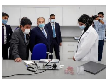
Minister Motegi's visit to JAIP