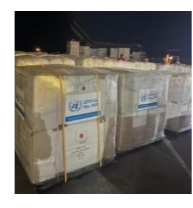
In-kind contributions to UNRWA based on its request under International Peace Cooperation Law

3. Supporting Palestinian People through Egypt In March 2024, Japan decided to implement "the Grant Aid Project for Medical Emergency Support to the Hospitals Affected by the Situation in the Gaza strip", amounting to approximately USD 8.3 million to Egypt through WHO.